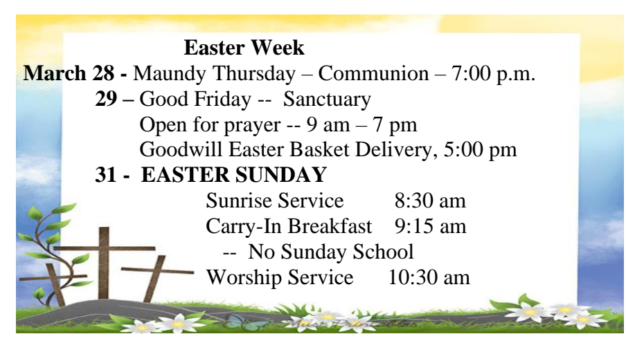
June 9 – 13 VBS – Seekers in Sneakers Discover Jesus!